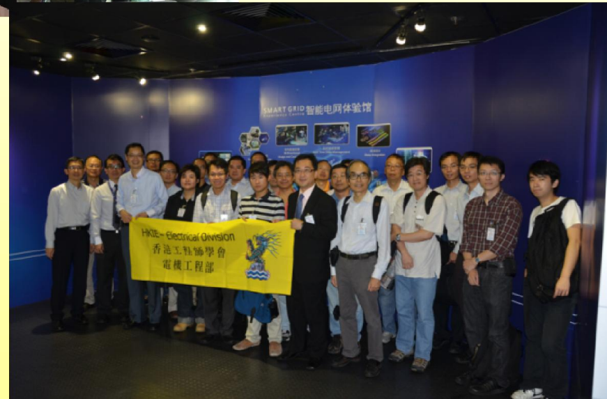
CLPP Smart Grid Experience Centre