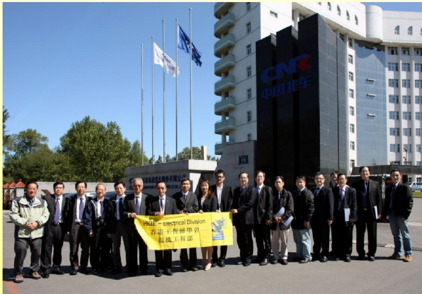
Changchun Railway Vehicles Co. Ltd