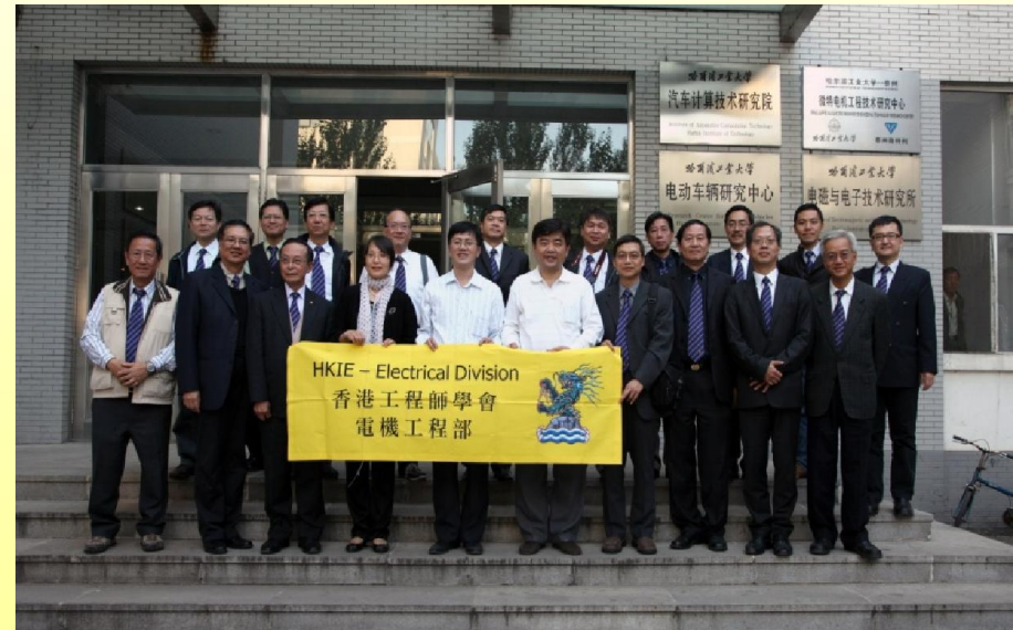
Harbin Institute of Technology