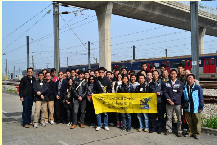
Pat Heung Depot