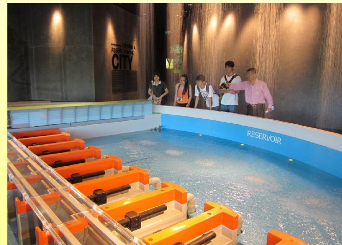
Technical Visit to Singapore