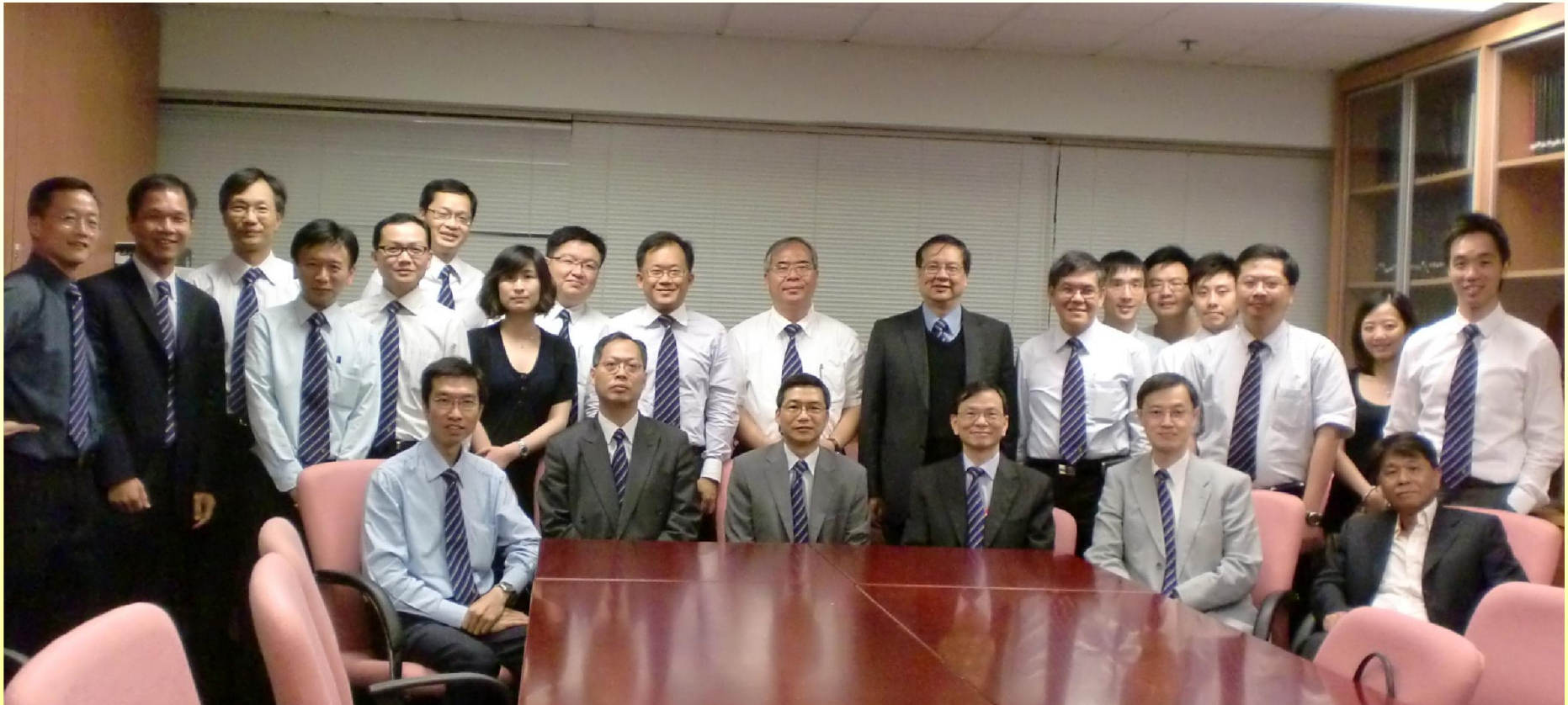
Electrical Division Committee Members