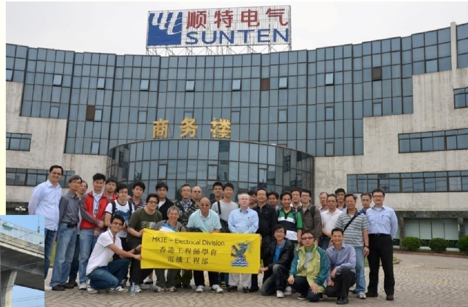
Sunten Electric at Shenzhen